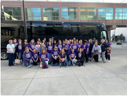
Region 8 Outing