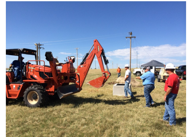
Sept. 7-8 in Sidney

Co-Sponsored by Utilities Section of League of Nebraska Municipalities and the Nebraska Rural Electric Association